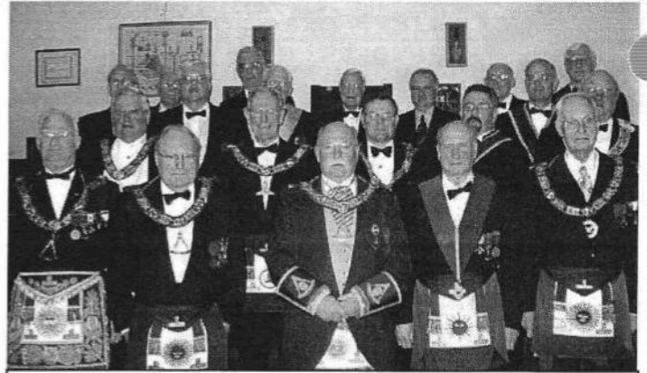
The Grand Master with his installation team