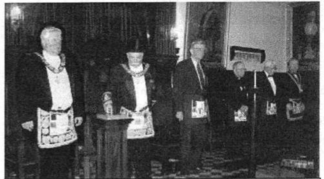
Grand Master lowers the gavel closing the Union Lodge of Portland for the last time.

The Union Lodge of Portland was the successor to Portland Union Lodge No. 324, Irish Registry. Warranted in 1842 the lodge operated for a mere three years before surrendering their warrant and obtaining a new one from the Grand Lodge of England.