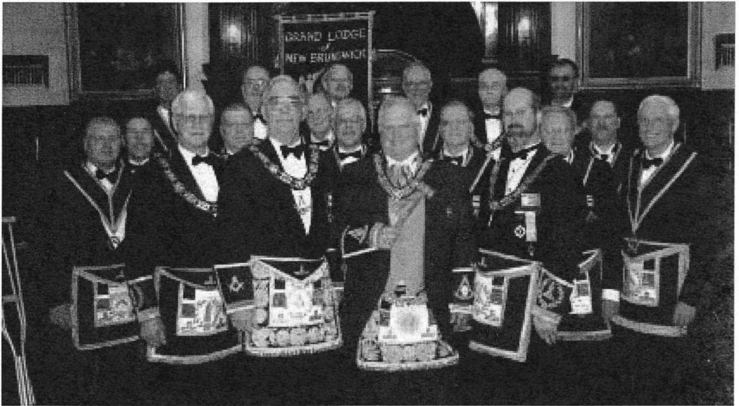
GRAND LODGE OFFICERS FOR 2005-06