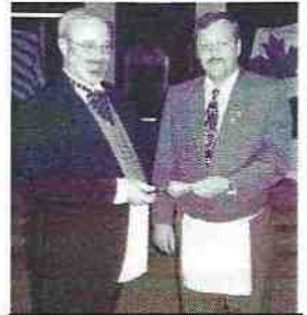
Grand Master presenting ceremonial trowel at Sunset Lodge

The annual returns have been sent out and are now in the hands of the Lodge Secretaries. I urge all of the Secretaries to help us to provide accurate reports to Grand Lodge by attending to this important task. The early receipt of the Lodge returns will greatly facilitate the task of compiling the annual reports for Grand Lodge.